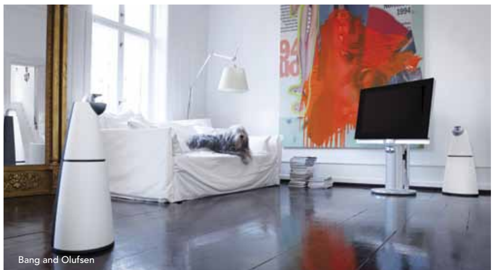
Bang and Olufsen