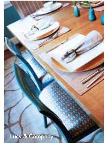
Lucy & Company