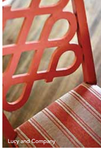
Lucy and Company