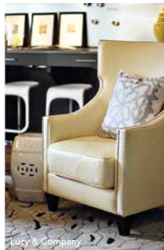
Lucy & Company